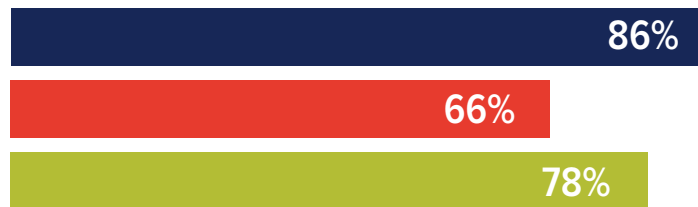
First-year college persistence rates for 2015/2016 (most recent data)

Crusaders persist to a second year in college at higher rates than all Rhode Island students.