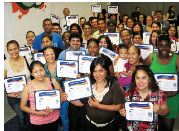
Look at all the certificates of high participation we handed out at our Parent Recognition Night in June!

We thank Home Loan Investment Bank for offering Crusade families five workshops from the FDIC Money Smart Program throughout the month of September. Dozens of Crusade families attended each week to learn from workshop sessions called Bank On It, Check It Out, Setting Financial Goals, Pay Yourself First, and Borrowing Basics.