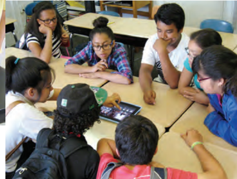
At right, middle school Crusaders attending Wheeler Summer Program collaborate on the editing of a video they storyboarded, shot, and starred in.